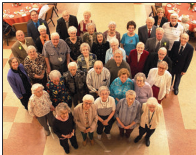
Members of The Heritage Society pictured at their 2015 annual luncheon.