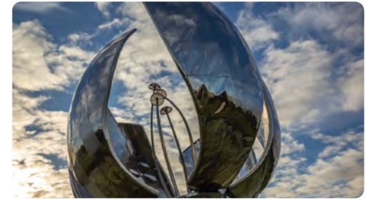
SCENE 3 - CONTINUE THE BEAUTY SHOTS OF BUENOS AIRES.

SPANISH FEMALE // V/O IMAGINE A MODERN CITY ENERGIZED BY ANCIENT TRADITION. WHERE KINGS AND QUEENS FROM AROUND THE WORLD ONCE PURCHASED GOLD AND SILVER. ARTISTS HAVE CALLED ITS BEAUTY "BEYOND BREATHTAKING."