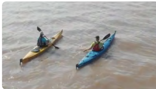
SCENE 11 - KAYAKERS ENJOYING THE BEAUTY OF THE DELTA ECOSYSTEM.

SPANISH FEMALE // V/O FEEL LIKE GETTING OUT? ENJOY A TOUR OF THE CITY. YOU CAN GO ON FOOT, BY BICYCLE, OR RELAX IN A MINI-BUS.