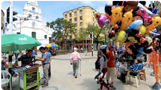
SCENE 4 - WE CUT TO NORMAL, UNTREATED FOOTAGE, SLIGHTLY FASTER EDITS, AND THE SCENES ARE FILLED WITH PEOPLE!

SPANISH FEMALE // V/O IMAGINE A CITY KNOWN AS "THE PARIS OF LATIN AMERICA..." ...AND "THE JEWEL IN THE CROWN OF ARGENTINA."