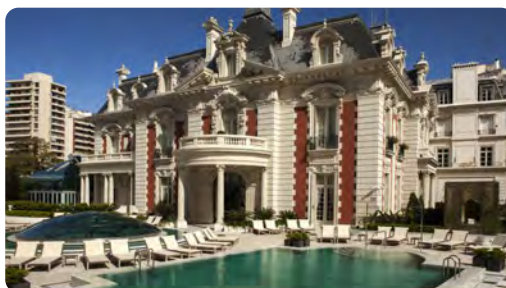
SCENE 14 - HOTEL SCENES AND AMENITIES.

SPANISH FEMALE // V/O AND THAT'S ONLY THE BEGINNING! YOU'LL SPEND 6 DAYS AND 5 NIGHTS AT THE FOUR SEASONS BUENOS AIRES.