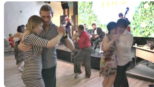
SCENE 12 - POLO LESSONS. THE TANGO DANCE PARTY.

SPANISH FEMALE // V/O READY FOR SOMETHING A LITTLE MORE ADVENTUROUS? JUST OUTSIDE THE CITY, YOU CAN QUENCH YOUR THIRST FOR EXCITEMENT WITH A KAYAK TOUR OF THE PRISTINE DELTA ECOSYSTEM.