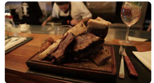
SCENE 9 - FOOD AND WINE.

SPANISH FEMALE // V/O FROM FOOD TO WINE TO CULTURE TO OUTDOOR ACTIVITIES, BUENOS AIRES HAS A TREAT FOR EVERY TRAVELER.