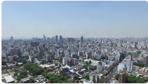
SCENE 1 - OPEN TO THE BUENOS AIRES SKYLINE.