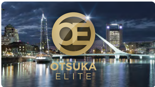
SCENE 7 - OTSUKA ELITE LOGO.

SPANISH FEMALE // V/O IN 2023, OTSUKA WILL HONOR ITS TOP PERFORMERS WITH AN INCREDIBLE REWARD. BUENOS AIRES, ARGENTINA!