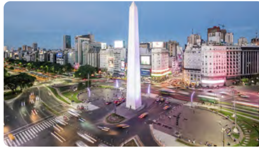
SCENE 2 - BEAUTY SHOTS OF BUENOS AIRES.

[THE FOOTAGE IN THIS OPENING SEQUENCE IS TREATED TO LOOK SLIGHTLY DIFFERENT FROM "NORMAL." AND WE COULD USE LONGER SHOTS HERE...OF THE SKYLINE AND THEN BUILDINGS, BRIDGES, ARCHWAYS, STATUES, ETC. WE SEE VERY FEW PEOPLE, AND THE CAMERA MOVES AS IF WE ARE "DREAMING OUR WAY THROUGH THE CITY:"]