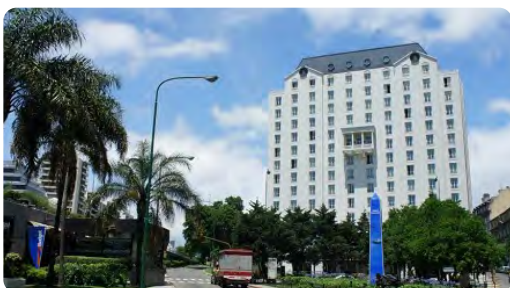
SCENE 13 - FOUR SEASONS BUENOS AIRES.

SPANISH FEMALE // V/O AND THAT'S ONLY THE BEGINNING! YOU'LL SPEND 6 DAYS AND 5 NIGHTS AT THE FOUR SEASONS BUENOS AIRES.