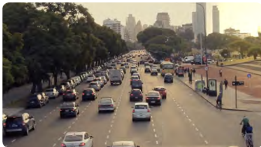
SCENE 10 - WALKING, BICYCLING AND MINI-BUS TOURS.

SPANISH FEMALE // V/O FEEL LIKE GETTING OUT? ENJOY A TOUR OF THE CITY. YOU CAN GO ON FOOT, BY BICYCLE, OR RELAX IN A MINI-BUS.