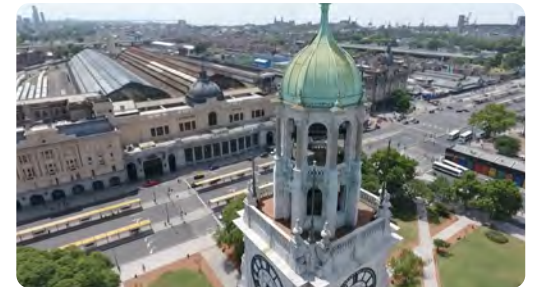
SCENE 6 - END OF MONTAGE