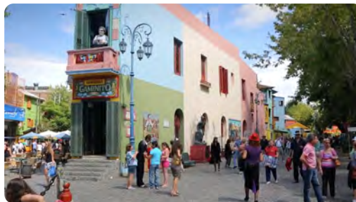
SCENE 8 - STREET FOOD AND DRINKS, SHOPPING, AND CULTURE.

SPANISH FEMALE // V/O FROM FOOD TO WINE TO CULTURE TO OUTDOOR ACTIVITIES, BUENOS AIRES HAS A TREAT FOR EVERY TRAVELER.