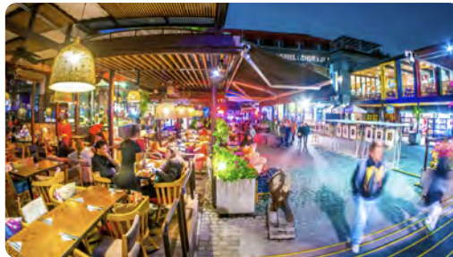
SCENE 5 - MONTAGE OF SCENES OF BUENOS AIRES